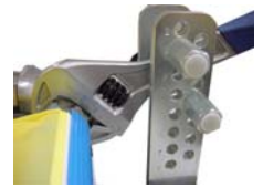
Numbered tension positions allow quick positioning of the locking pins.