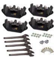
SA 1000 Kit $1999.00