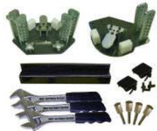
SA 250 Kit $1449.00

Available in tensioning kits or complete turntable configurations – see options and pricing below.