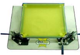
SA 250 w/Table $1749.00