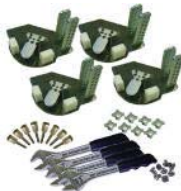
SA 500 Kit $1599.00